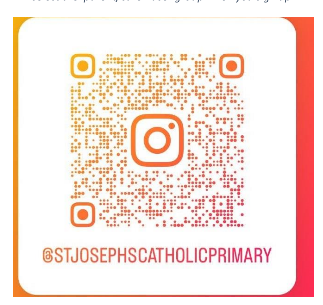
5 - Please scan for our Instagram page.

Within school, we are able to see which courses that you have completed, but not any other details. Please ensure that you select the 'parent/carer' user group when you sign up.